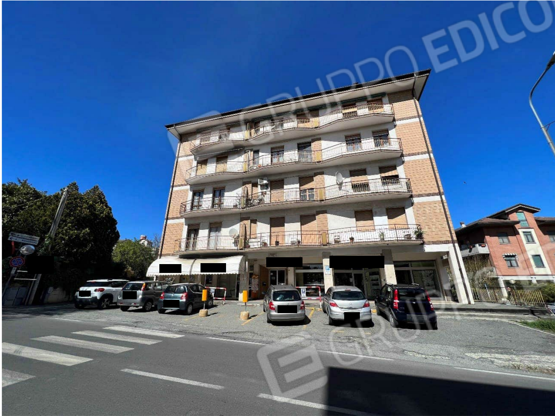
Figura 1 vista stabile condominiale