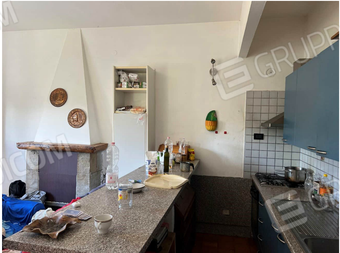
Figura 6 cucina