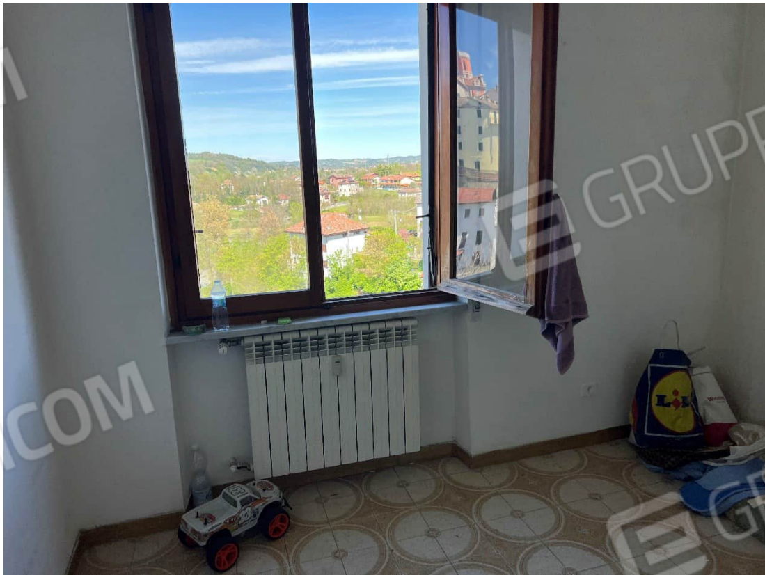
Figura 8 camera