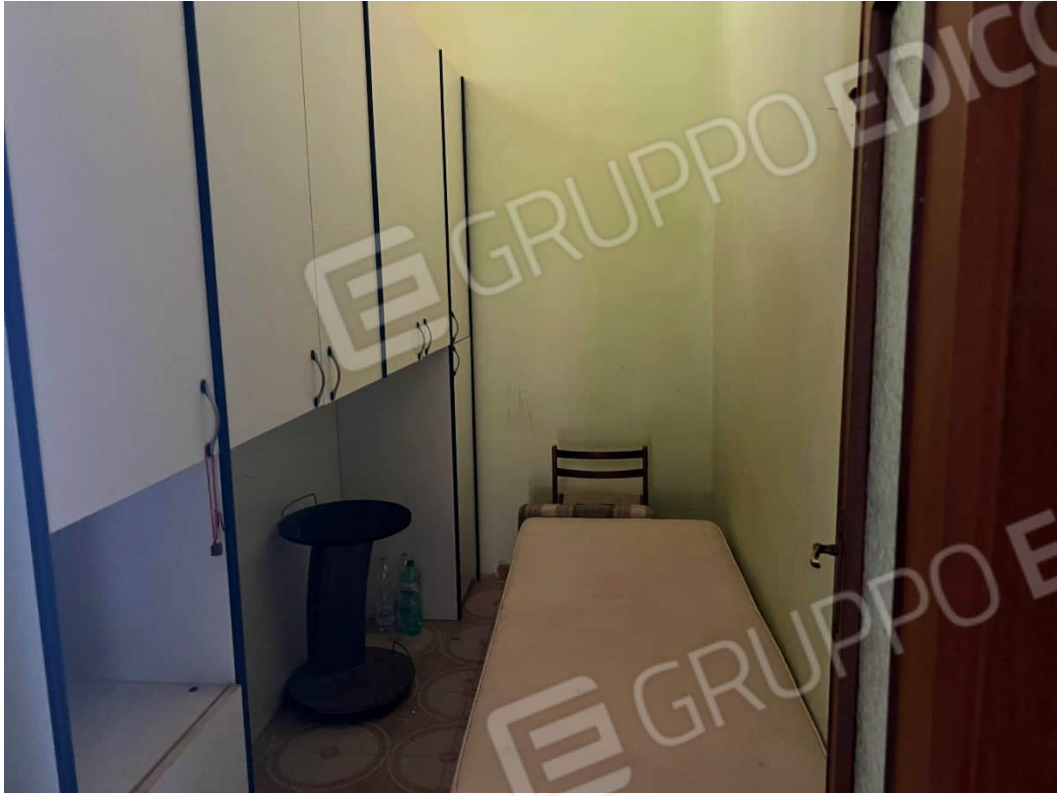
Figura 7 camera