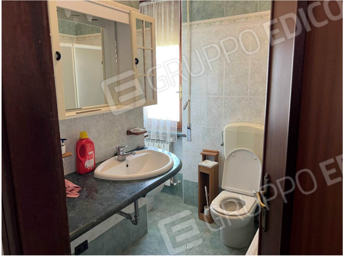
Figura 9 bagno