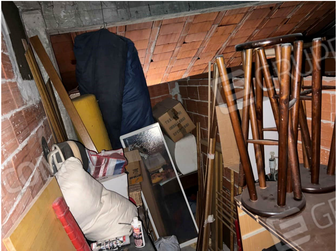
Figura 10 solaio