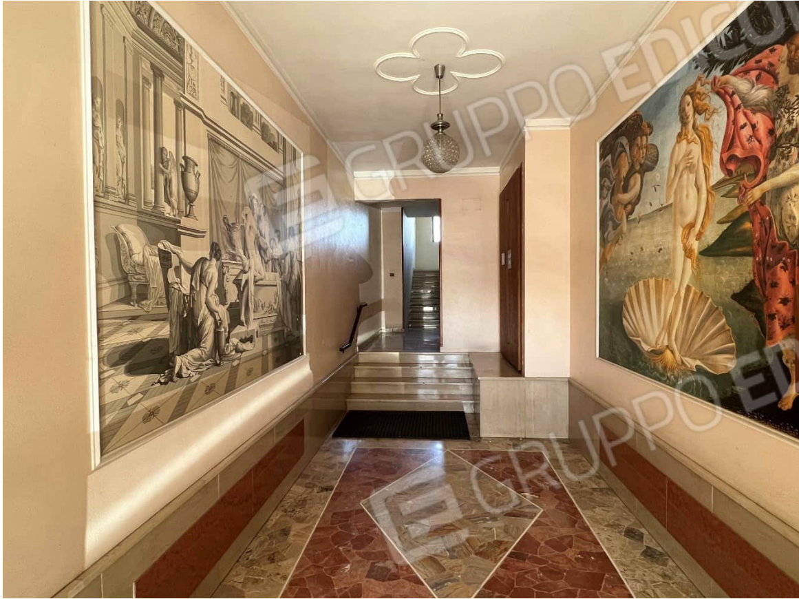
Figura 3 androne condominiale