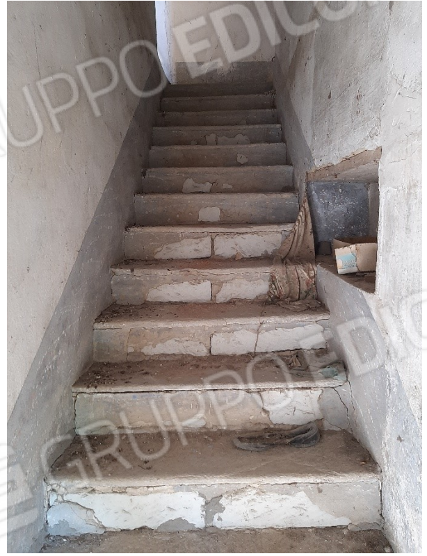
BENE N° 2