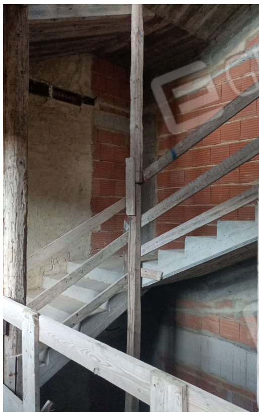
VISTA SCALA CONDOMINIALE