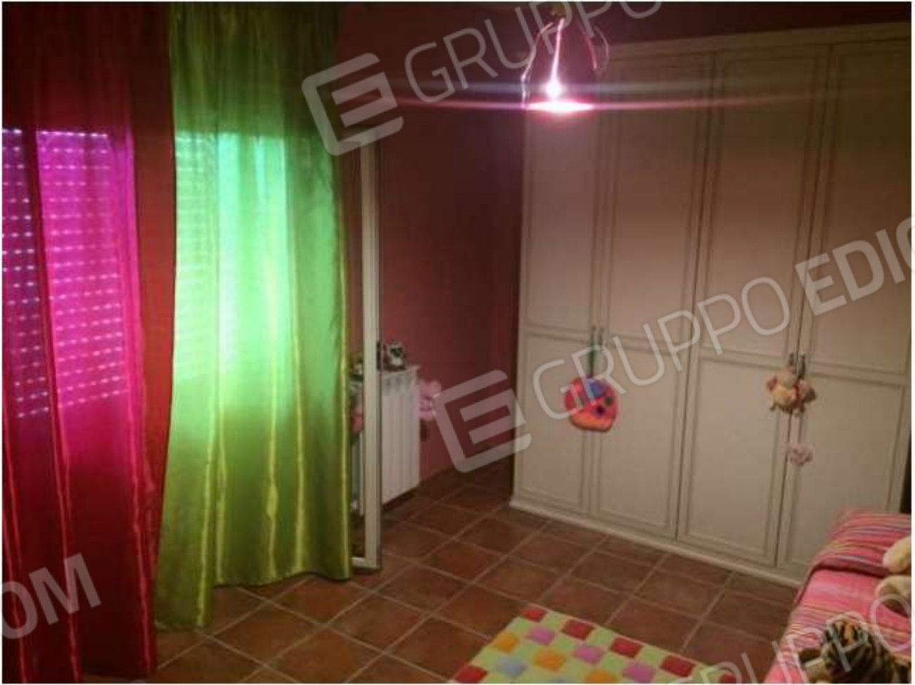
Figura 7 – Cameretta