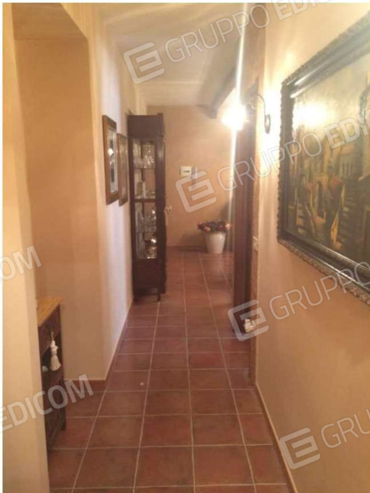
Figura 3 – disimpegno