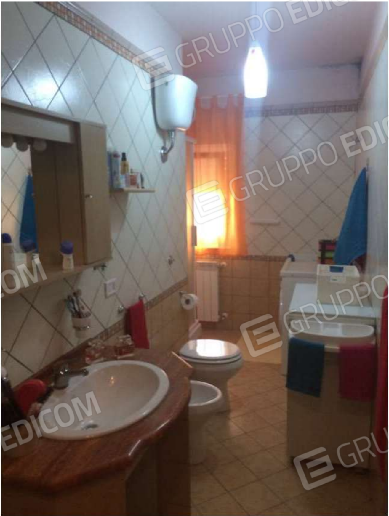
Figura 4 – Bagno secondario