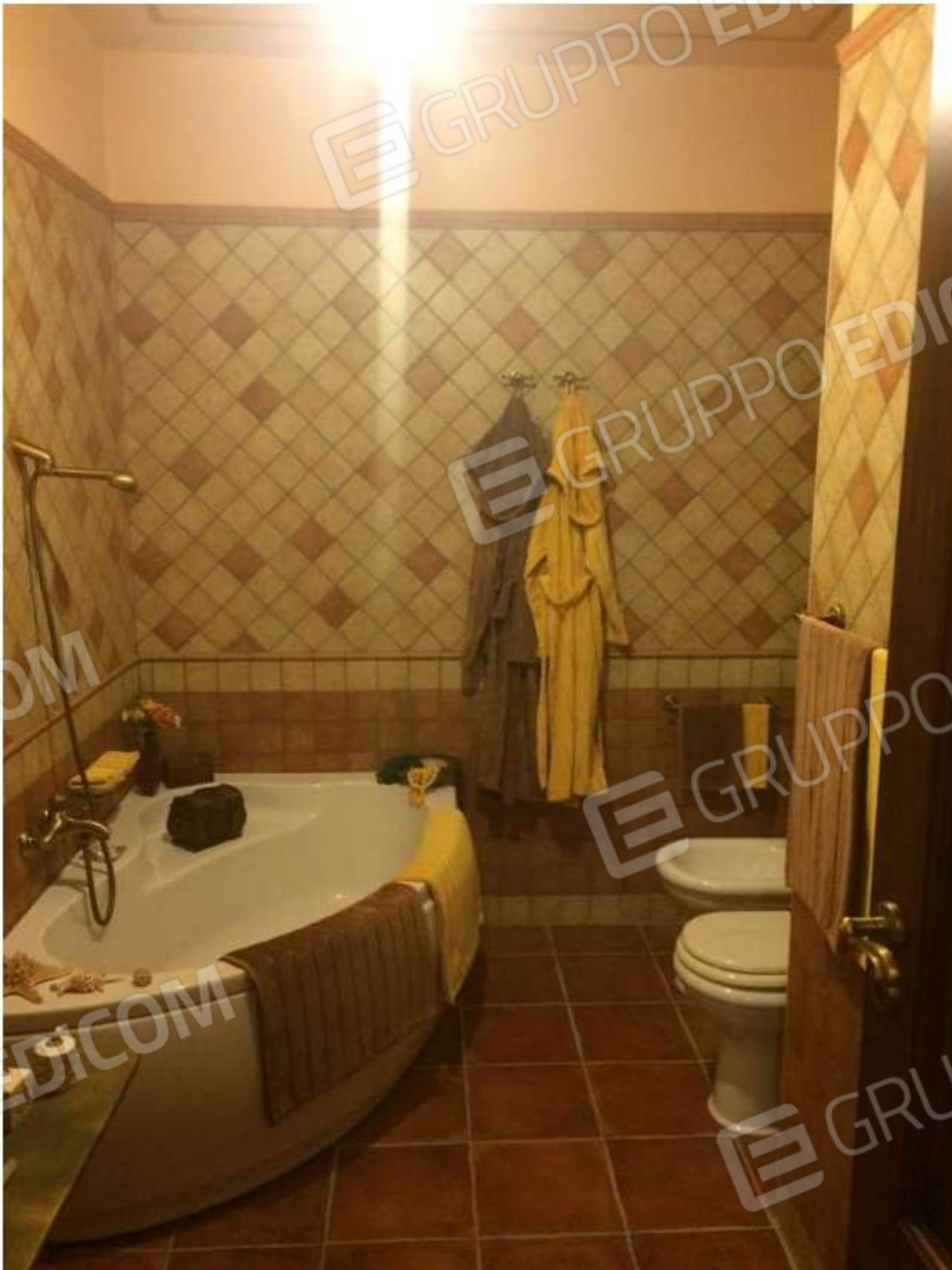
Figura 8 – Bagno principale