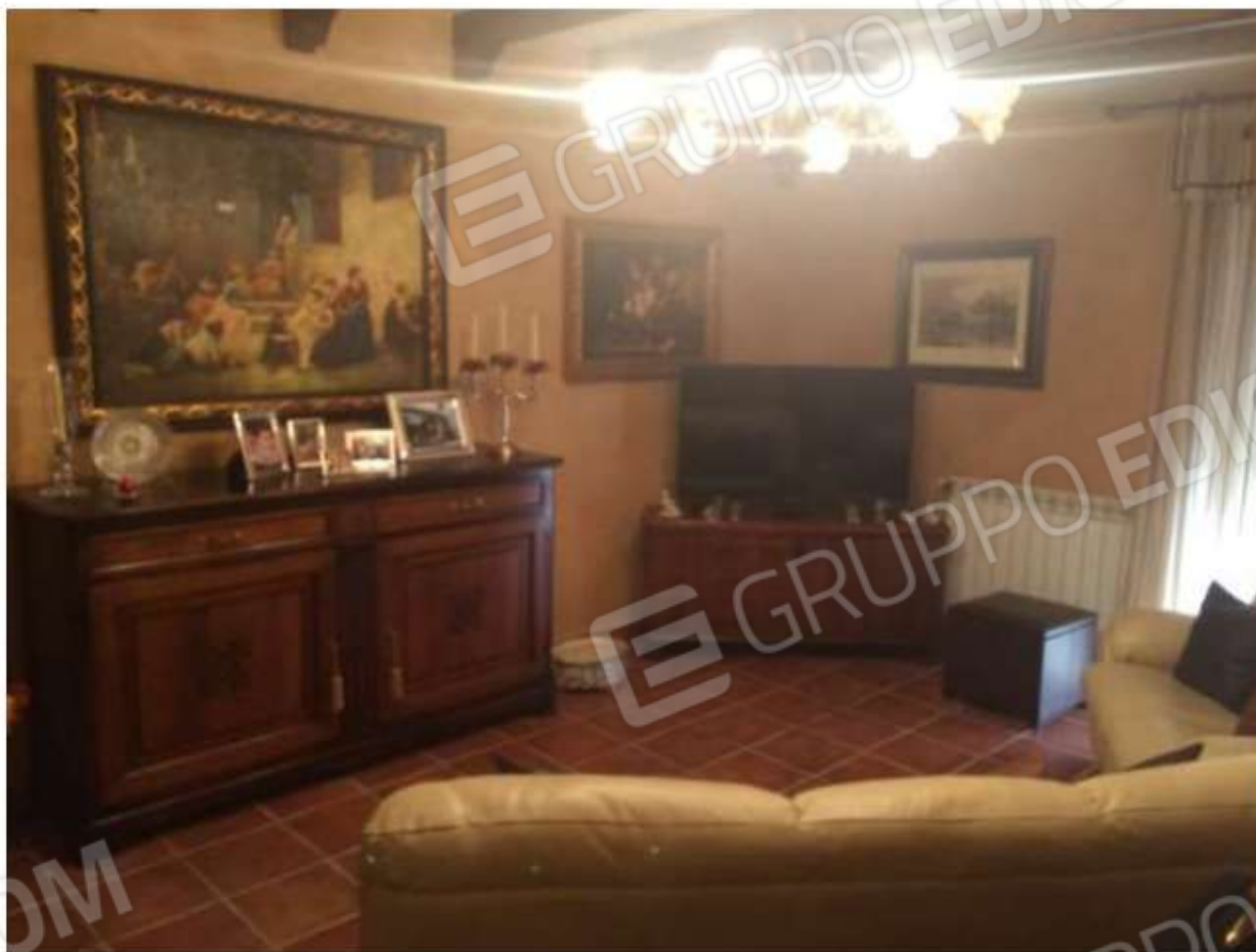
Figura 1 – Ingresso/salotto