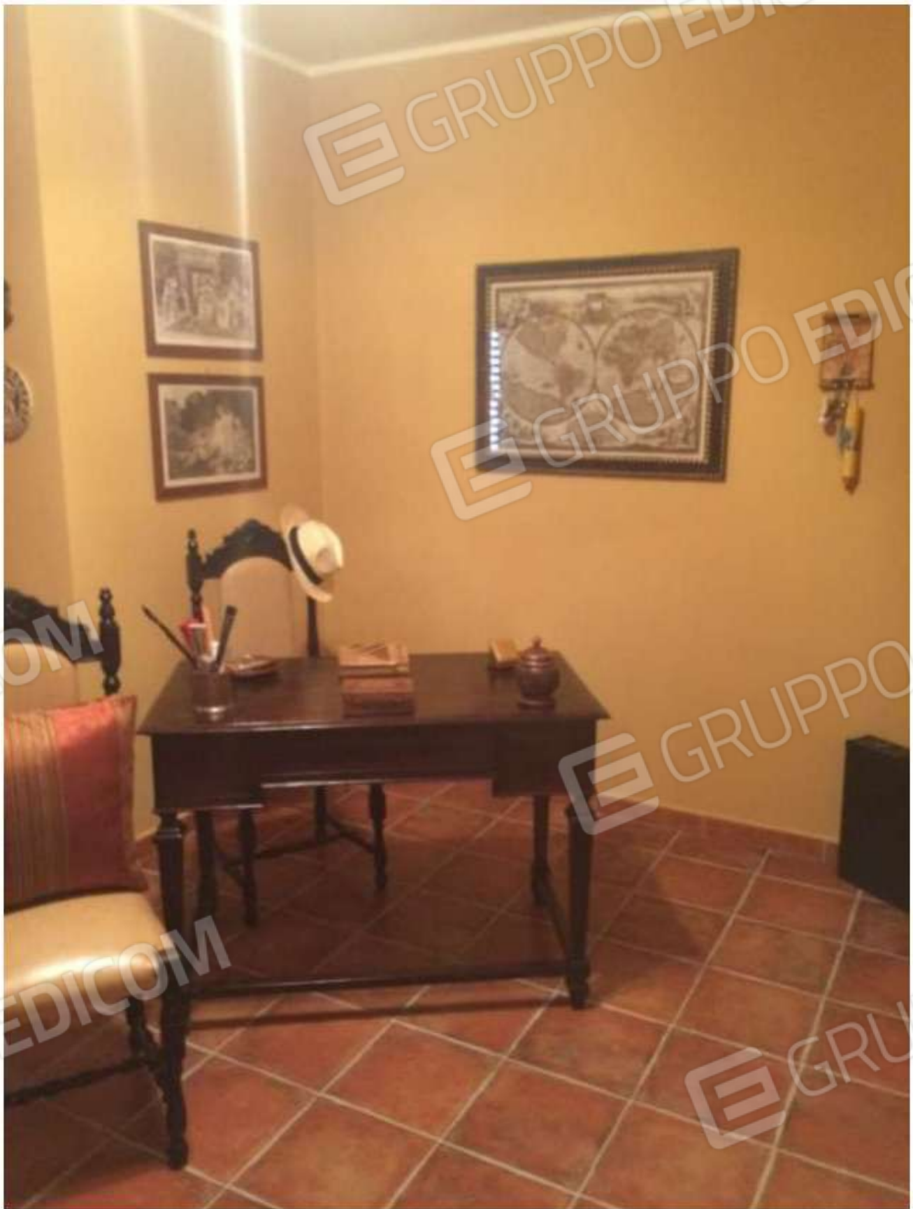
Figura 5 – Studio