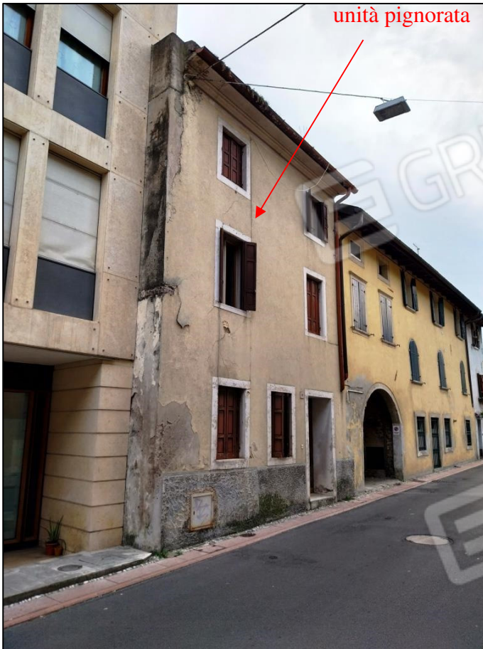
1) Fronte nord – su via L. Da Ponte