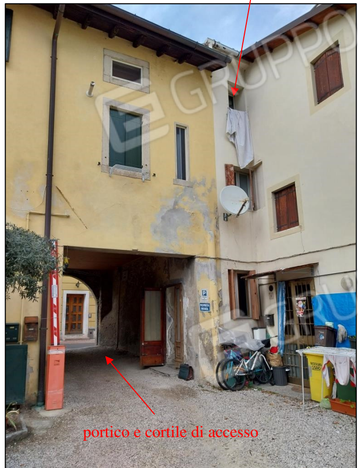
2) Lato sud