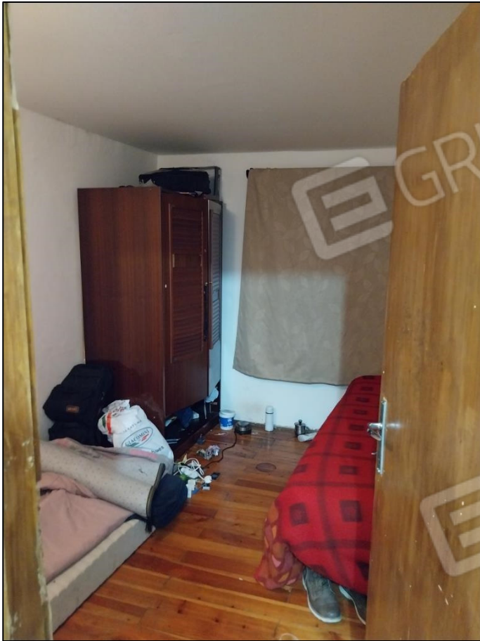
Piano secondo – camera