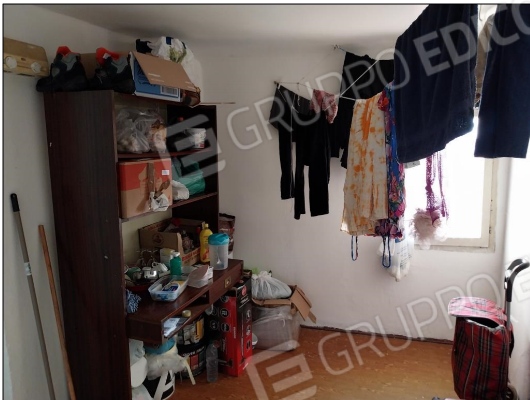
11) Piano secondo - disbrigo