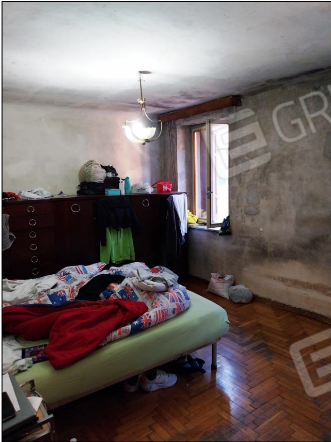
7) Piano primo – camera