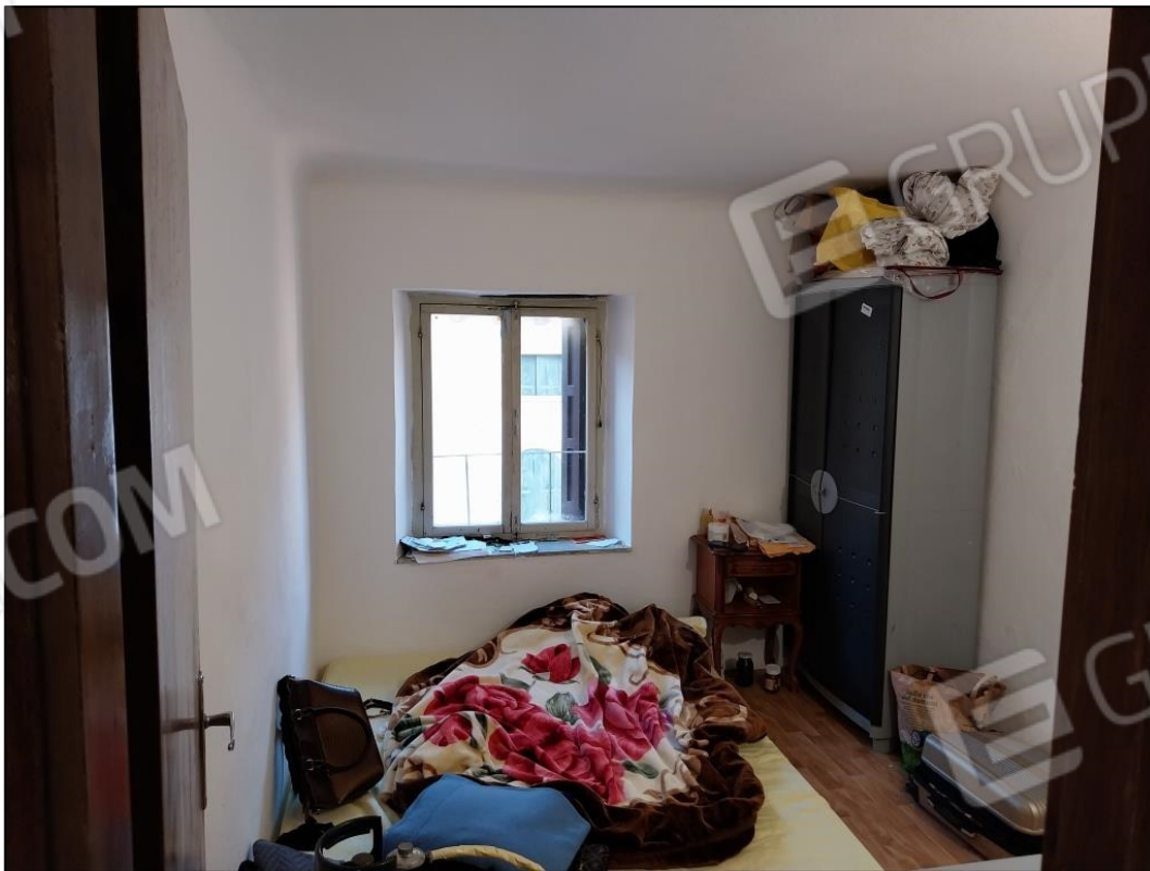
12) Piano secondo – camera