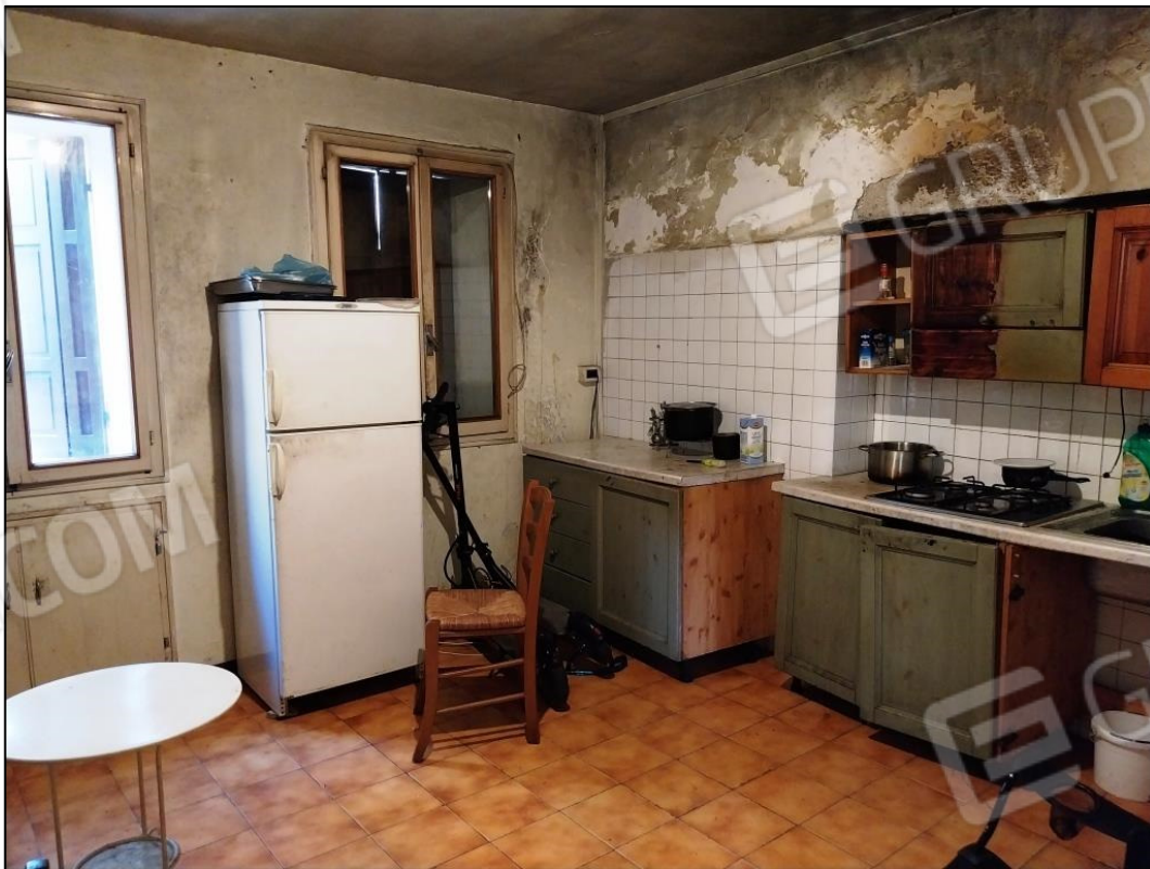
6) Piano terra – cucina