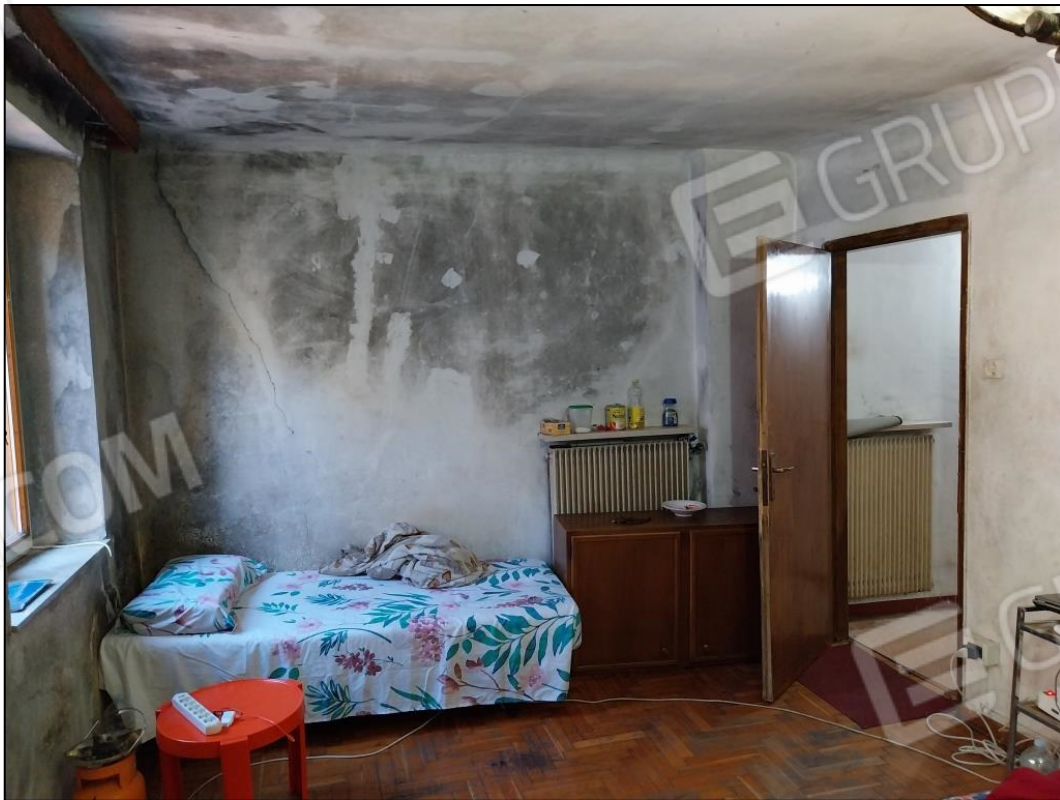
8) Piano primo - camera