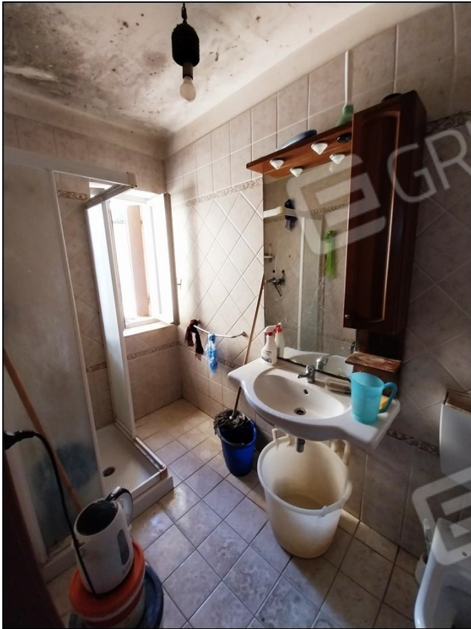
9) Piano primo – bagno