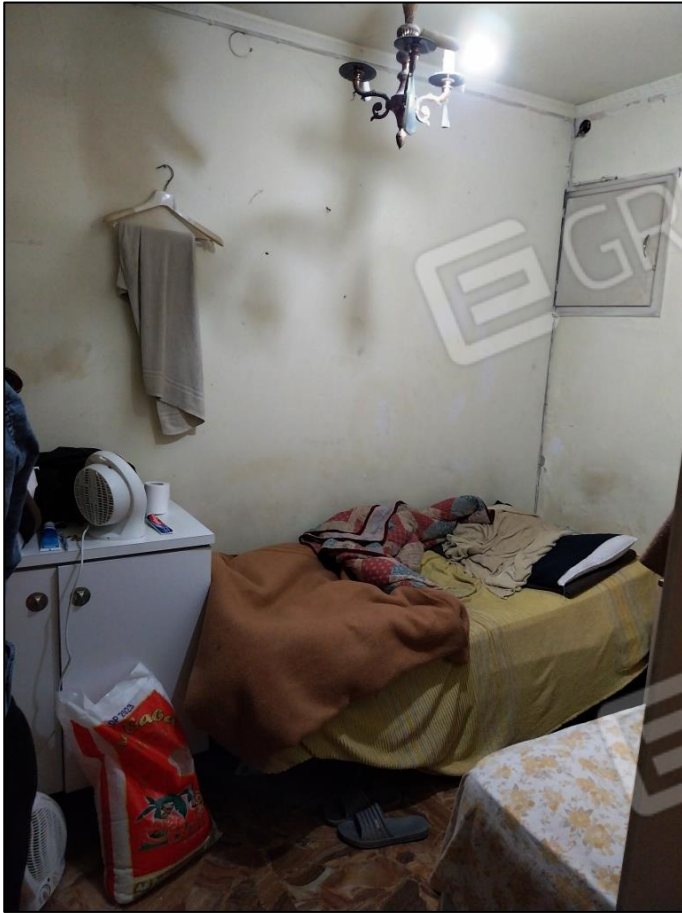
5) Piano terra – lavanderia utilizzata a camera