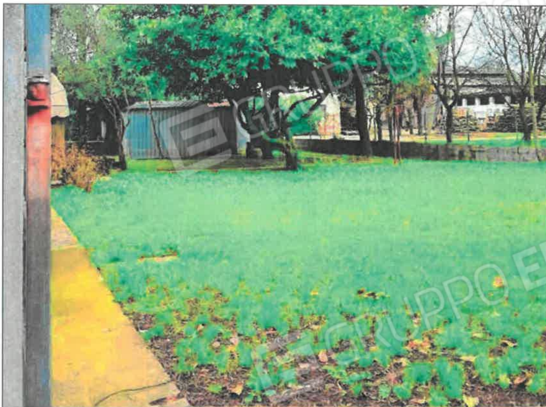
(3 – CORTILE ESCLUSIVO A NORD)