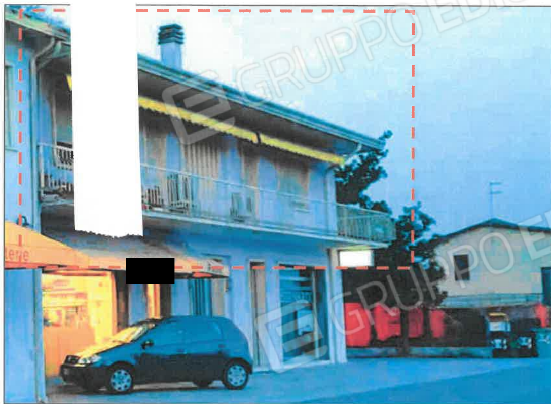
(1 – ESTERNO ABITAZIONE LATO SUD)