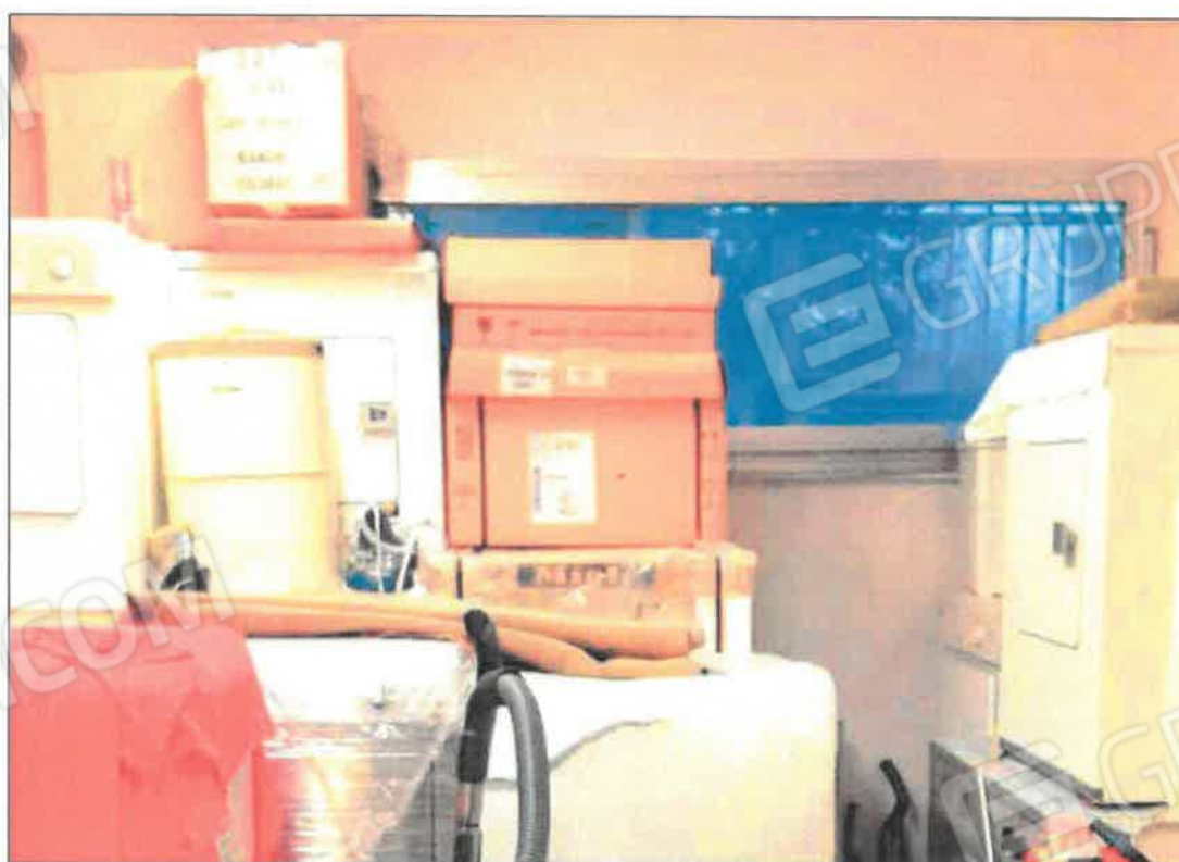
(4 – DEPOSITO P.T.)