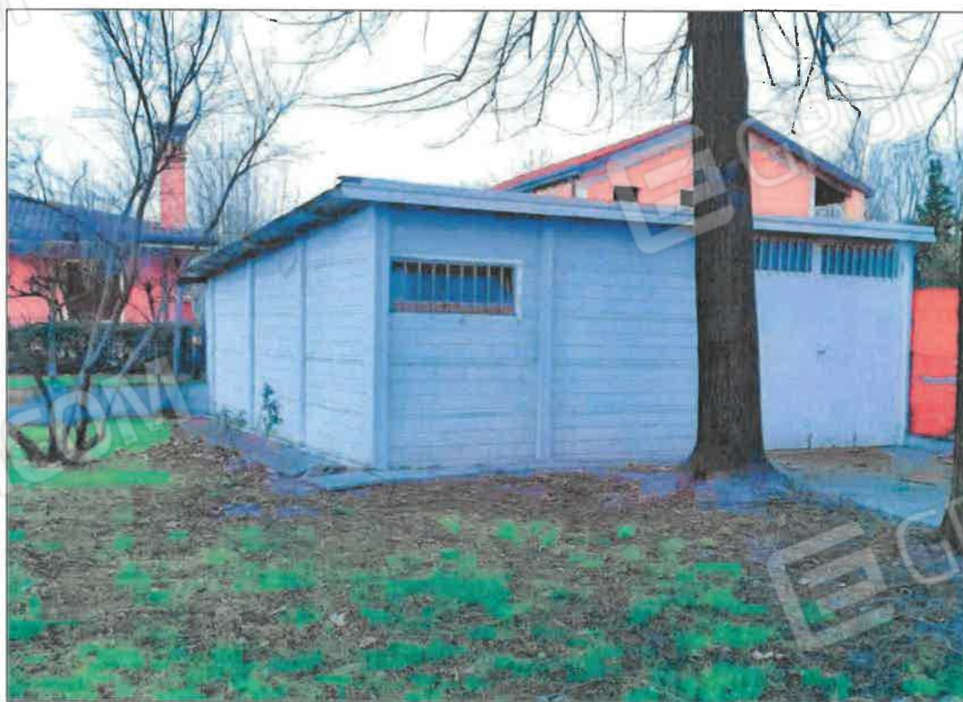
(2 – GARAGE)