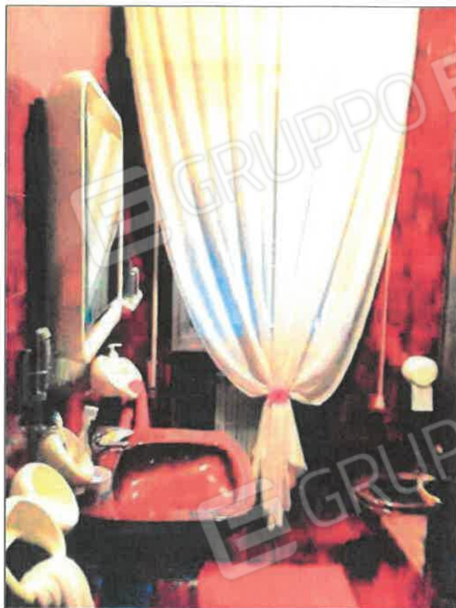
(7 – BAGNO P.1°)