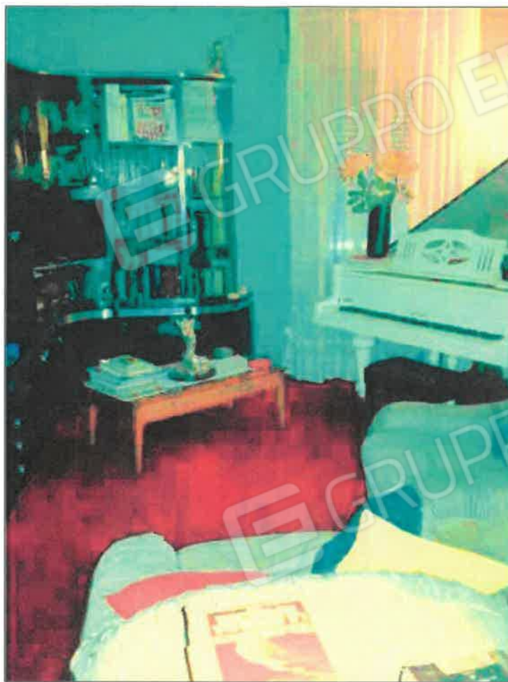
(5 – SOGGIORNO P.1°)