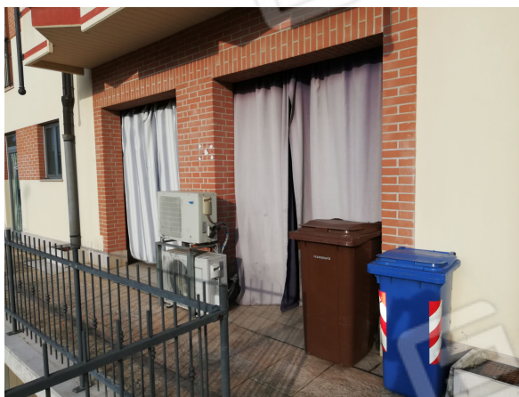
ACCESSI SUL RETRO