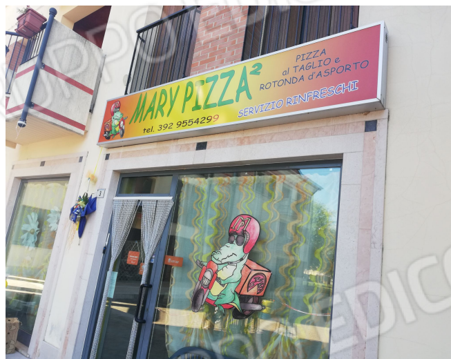
VETRATA D'INGRESSO VISTA DALLA PIAZZA