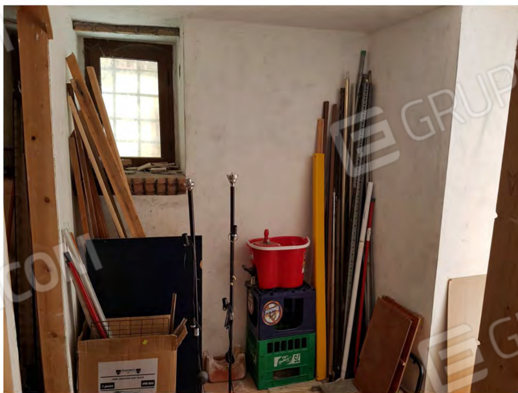
Figura 2 – Disimpegno