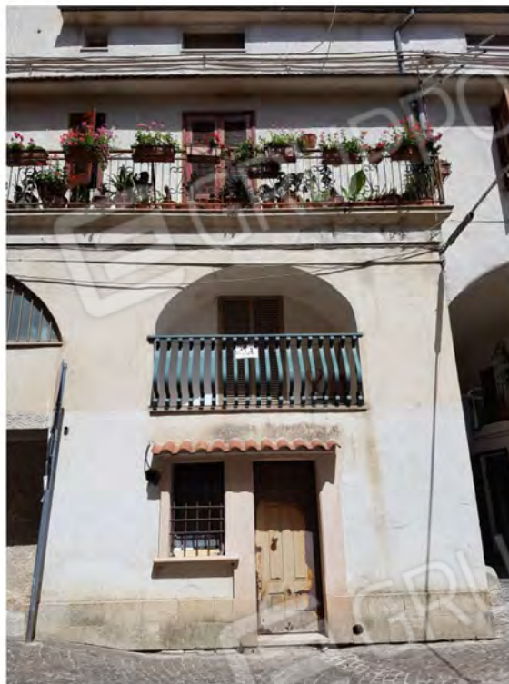
Figura 1 – Ingresso