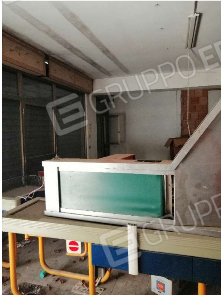
Sub 38 - 1