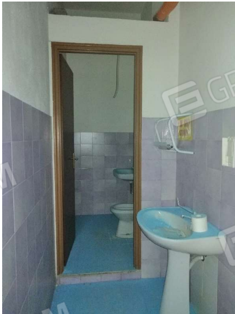
Sub 27 - 6