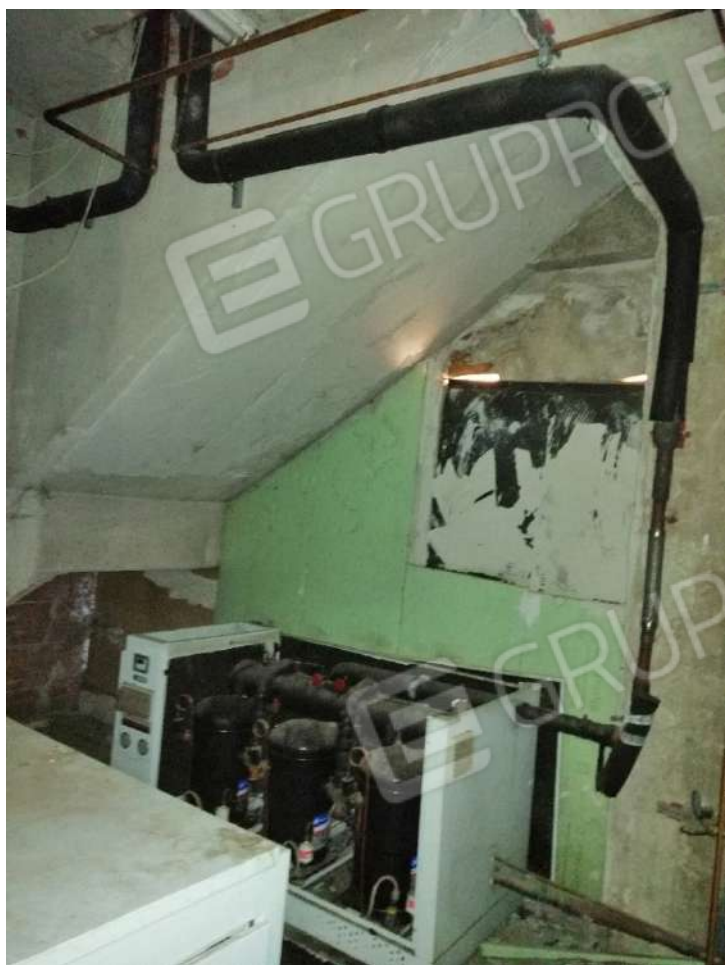
Sub 38 - 12