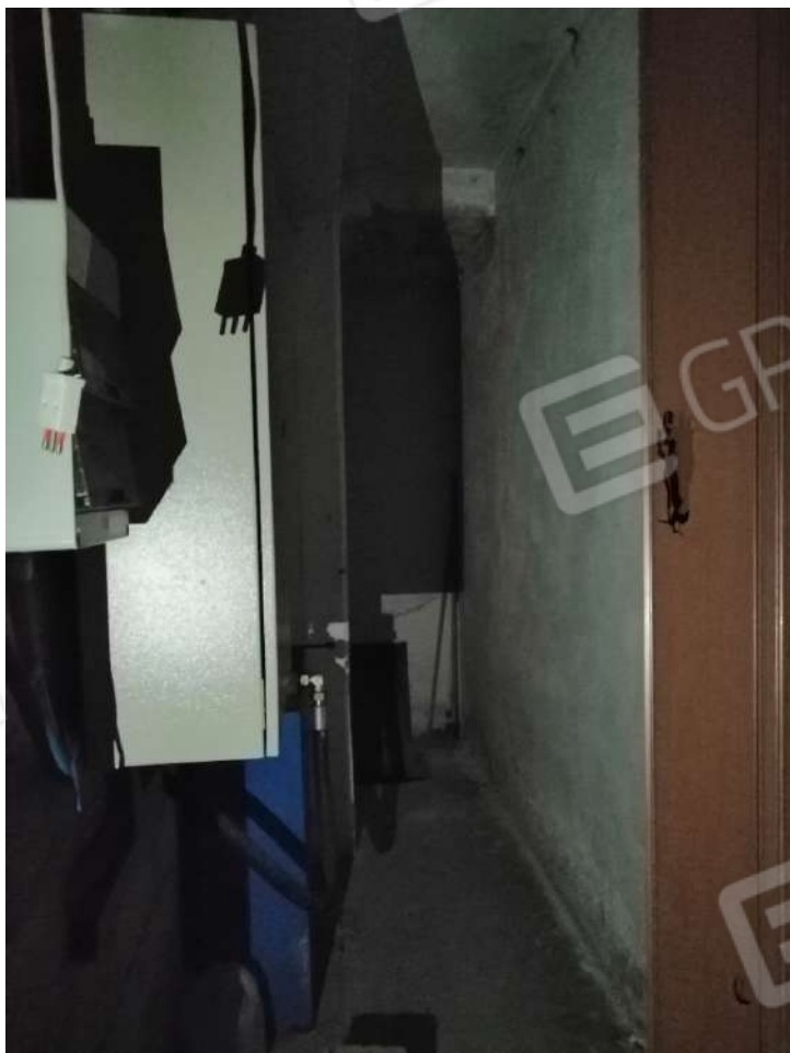
Sub 38 - 11