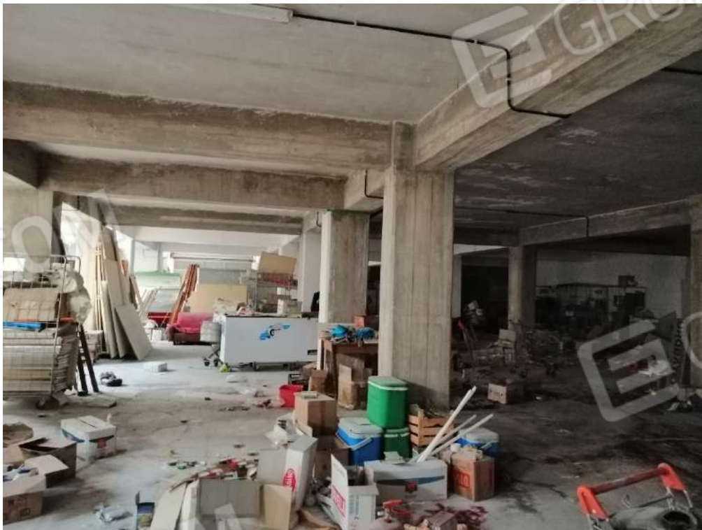
Sub 38 - 2