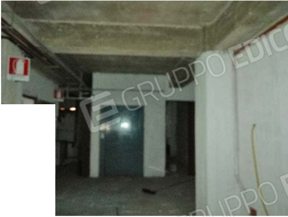
Sub 38 - 9