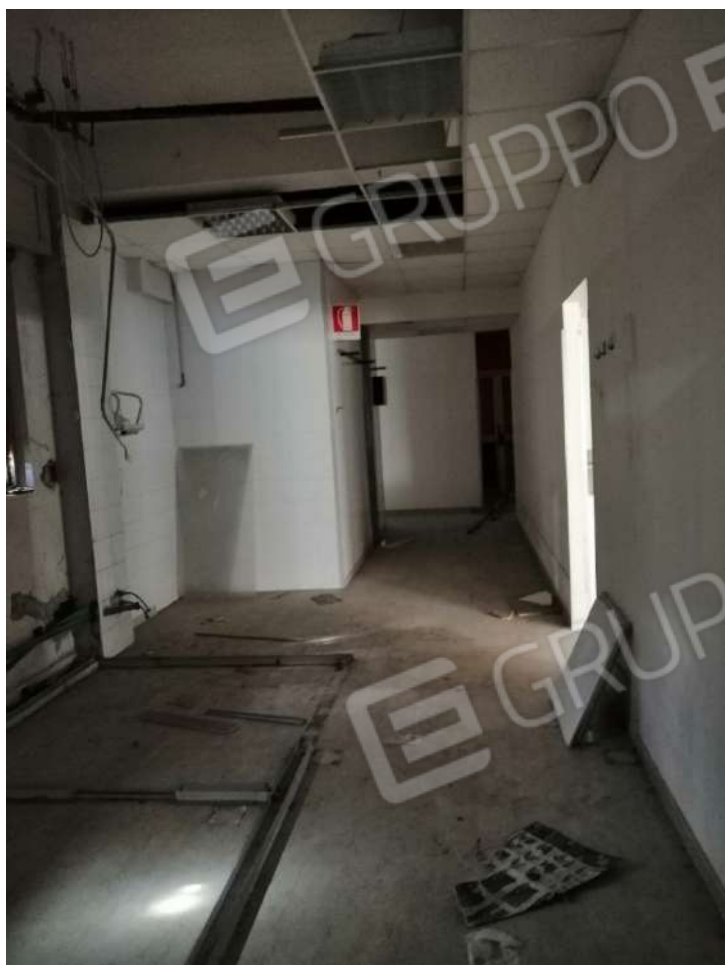
Sub 27 - 8