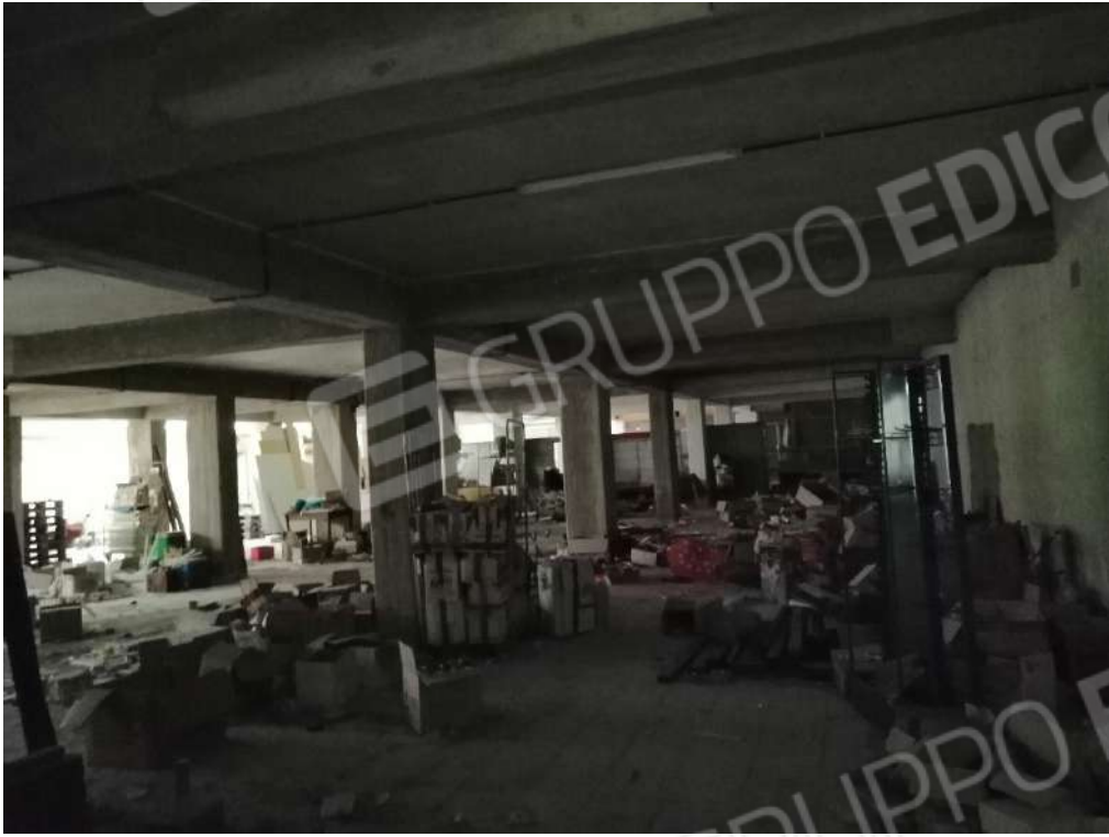
Sub 38 - 3