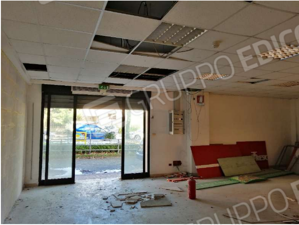
Sub 27 - 1