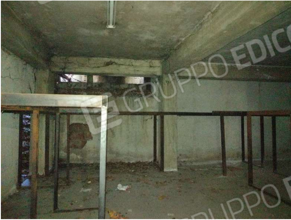
Sub 38 - 5