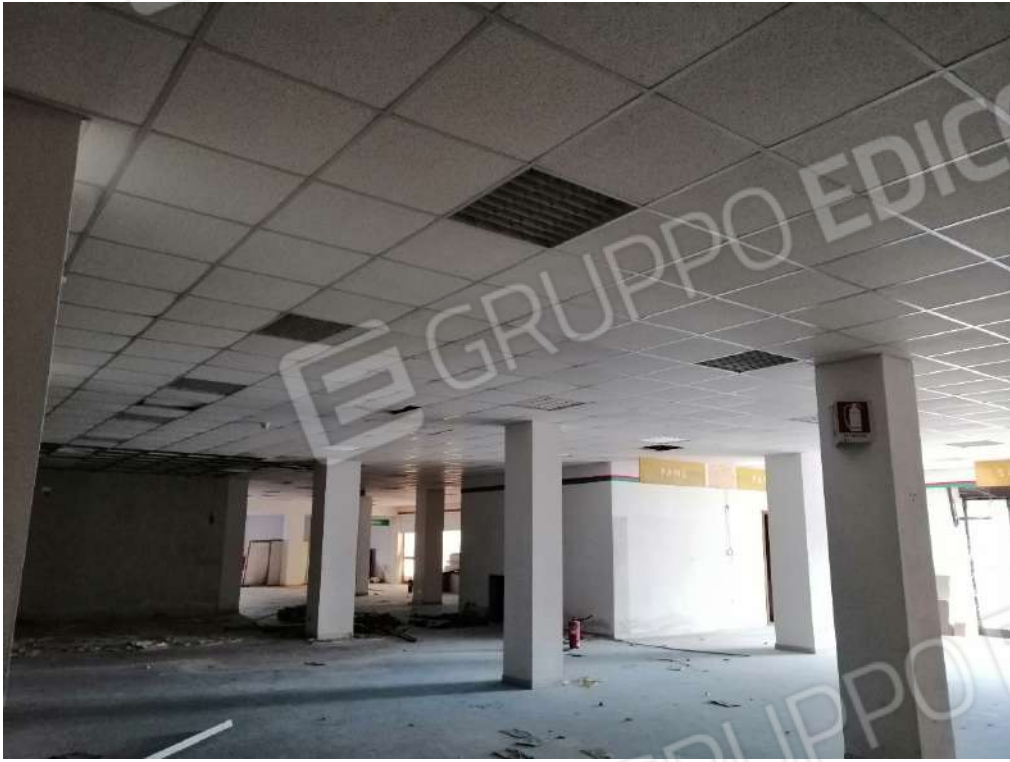
Sub 27 - 5