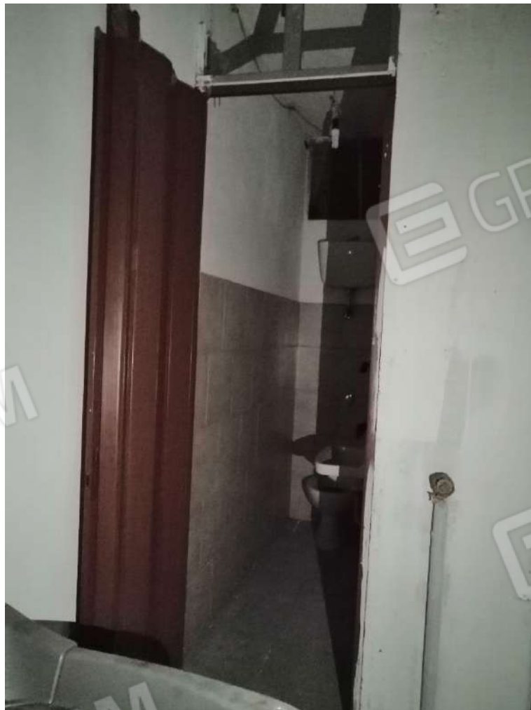
Sub 38 - 10