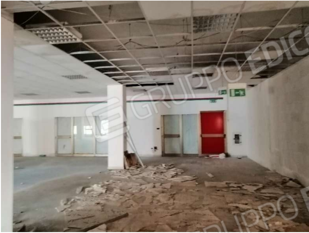
Sub 27- 3