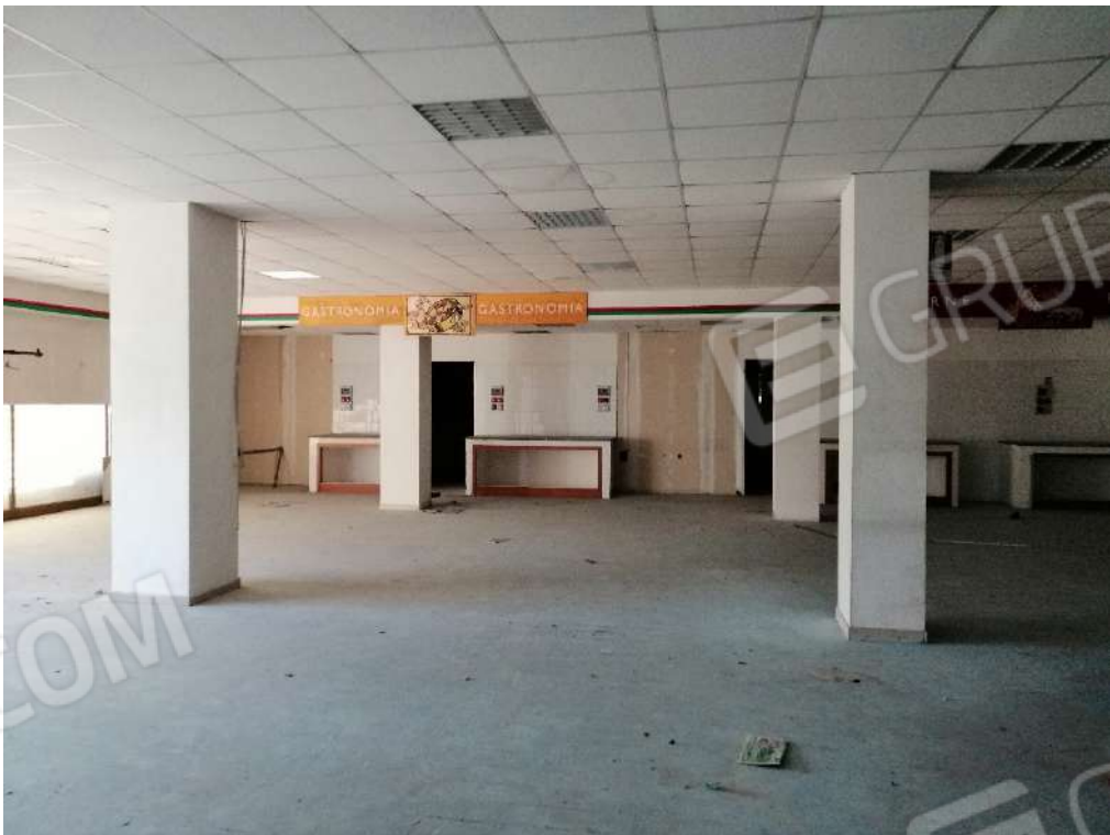
Sub 27 - 4