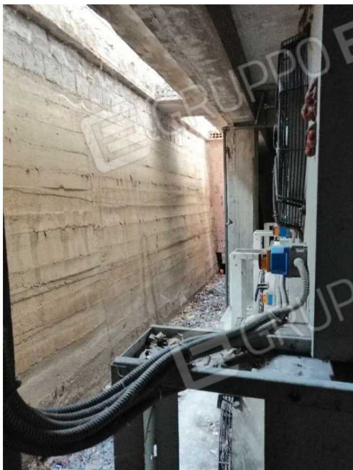
Sub 38 - 8