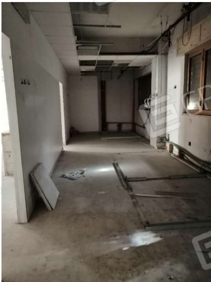
Sub 27 - 7