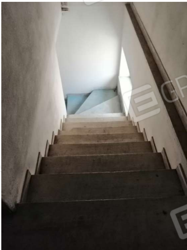
Scala - 1