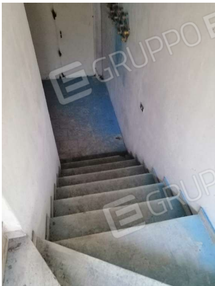
Scala - 2