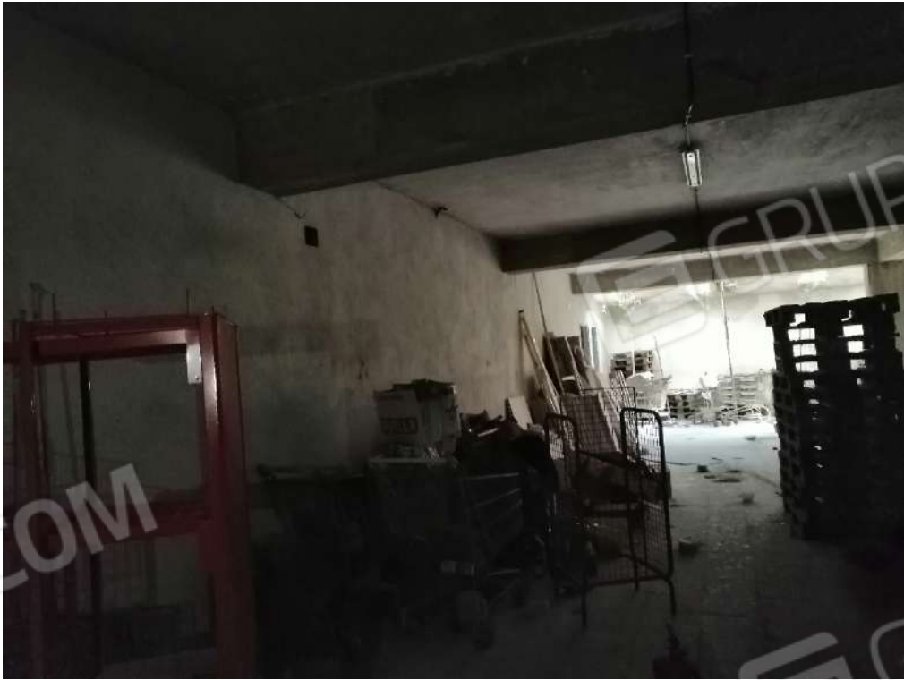
Sub 38 - 4