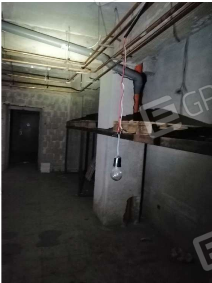
Sub 38 - 7