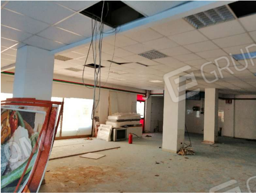
Sub 27 - 2