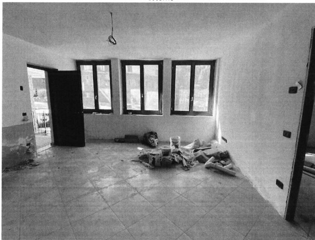
Interno ufficio particella 4246 sub 9