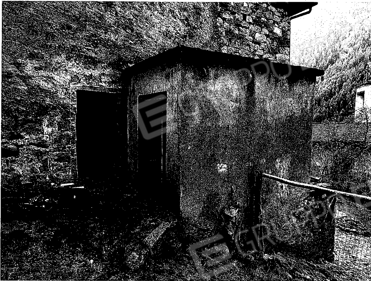
Vista esterna particella n.22 sub.9