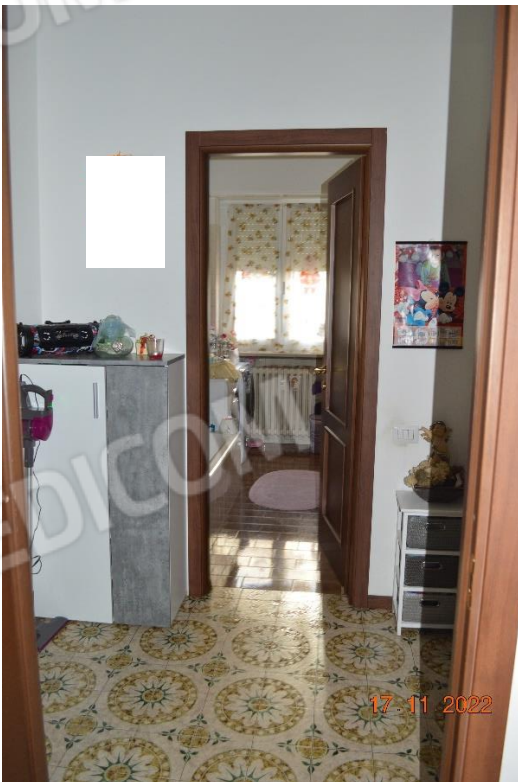
DISIMPEGNO ZONA NOTTE