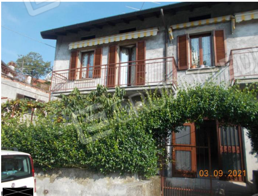
Foto 1 Ingresso abitazione e autorimessa