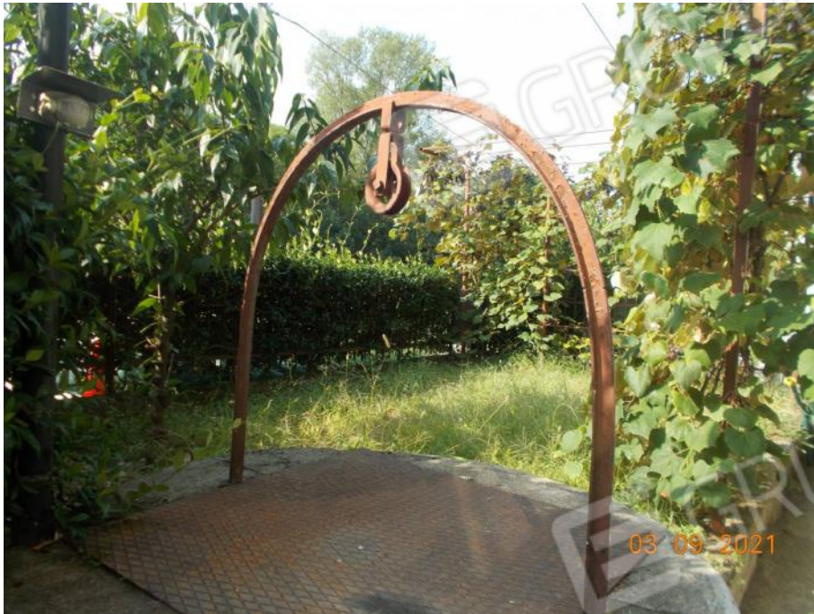
Foto 2 Area esterna PT